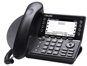
IP480 / IP480g