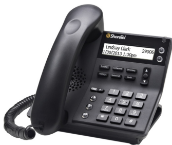
IP420 / IP420g