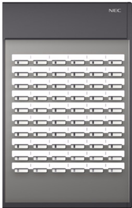
60-Button DSS Console