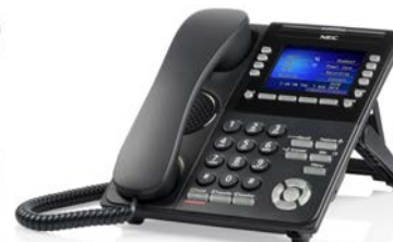
DT920 – Self-labelling