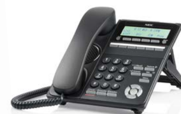
DT530 – 6/12 button