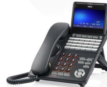
DT930 – 24 button