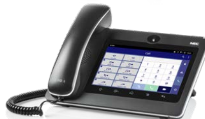
GT890 – IP Videophone