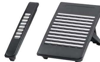
Key Modules – 8 & 60-line