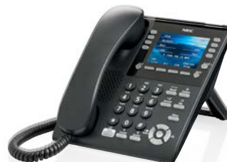
DT820 – Self-labelling