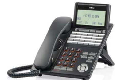
DT530 – 24 button